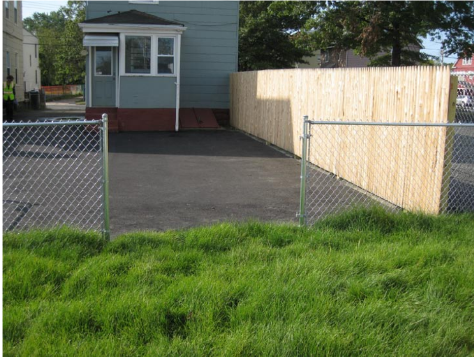
View looking South at restored driveway and parking area