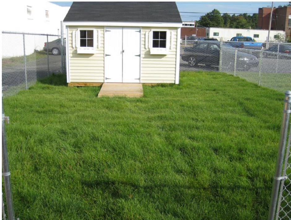
View looking North at newly installed shed