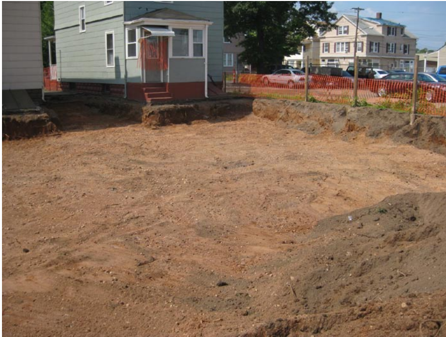
View looking Southwest at full excavation area