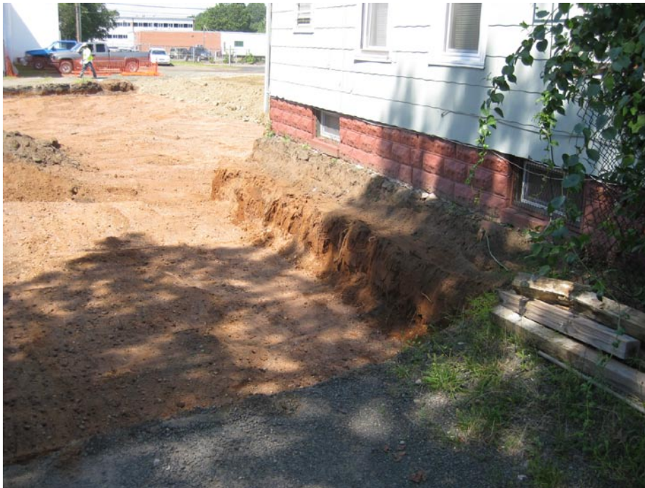
View looking Northeast at edge of excavation in driveway